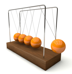
Figure 2.1: One image.

Also, you can insert many images in the same structure like in Fig. 2.2. IAT<sub>E</sub>Xaccept different formats for the figures like jpg, png or pdf.