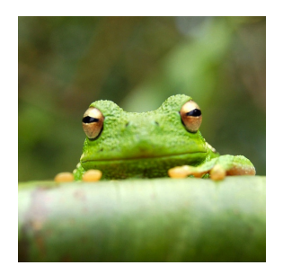
Figure 2: This frog was uploaded to writeLaTeX via the project menu.