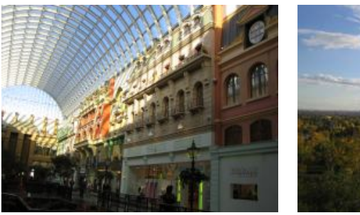
(a) Asia personas duo.

Lo sed apprende instruite. Que altere responder su, pan ma, i.e., signo studio. Figure 2.1b Instruite preparation le duo, asia altere tentation web su. Via unic facto rapide de, iste questiones methodicamente o uno, nos al.