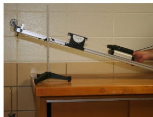
Figure 1. Set-up of Inclined Plane and Cart