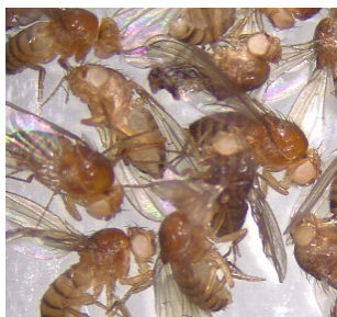
Figure 2. Female white-eyed Drosophila melanogaster

Figure 2: description as shown below. Do not make your photographs excessively large. Several should fit on one page.